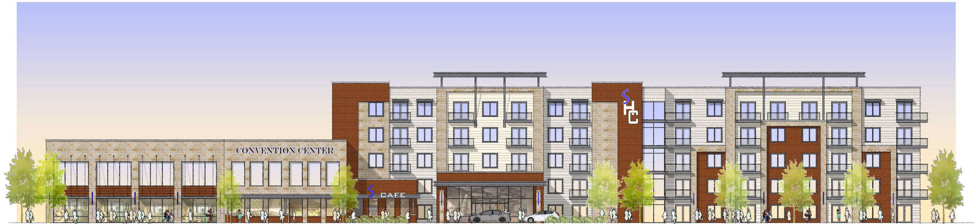
01 CONCEPTUAL ELEVATION DESIGN -- CONVENTION CENTER / HOTEL